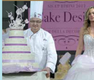
PASTRY INTERNATIONAL FORUM & CAKE DESIGN