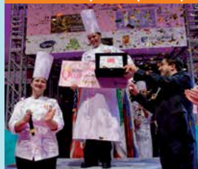
JUNIORES / QUEEN Italian Pastry Championship