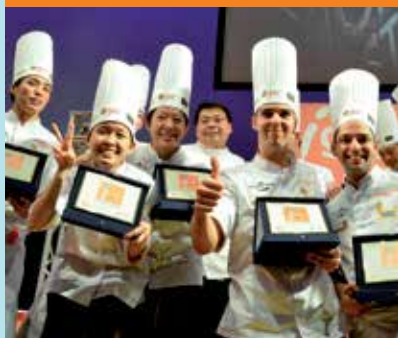
JUNIORES PASTRY WORLD CUP