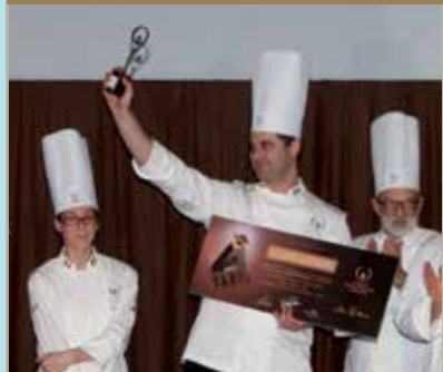
WORLD CHOCOLATE MASTER Italian selection