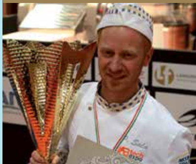
BAKERY EVENTS new edition