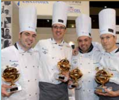
GELATO D'ORO Italian selection